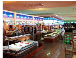
Restaurant Food stands